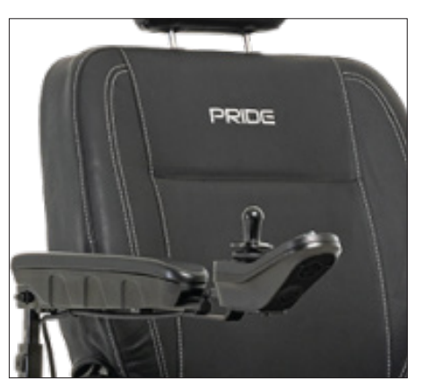
Optional Swing Away Controller Mount