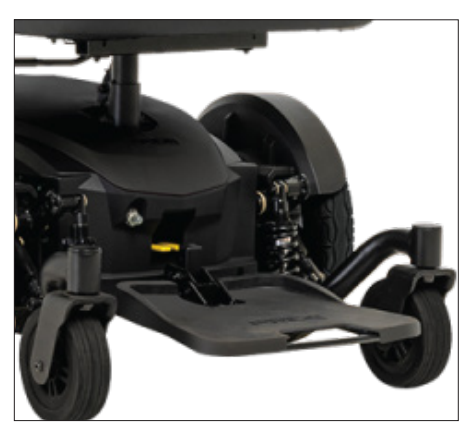
Large Footplate with Removable Cover