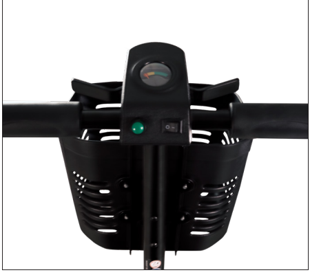
Easy to Use and Steer Controls